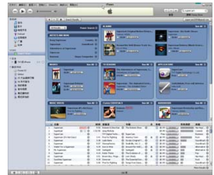
Step 3: Search for "SuperCam"