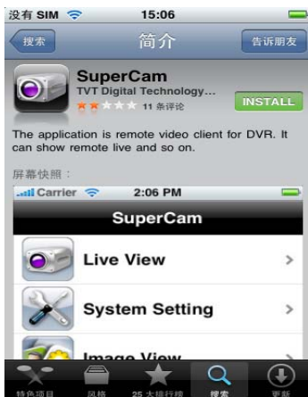
Step 4 : press “INSTALL”