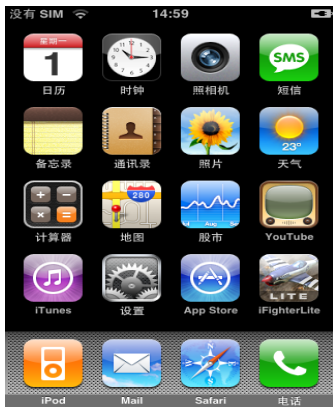
Step 1: Go to iTunes