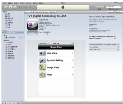
Step 4: click on "SuperCam", and then log in with iTunes user name and pass word to download