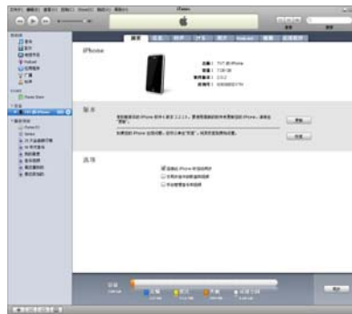
Step 2: connect iPhone to PC