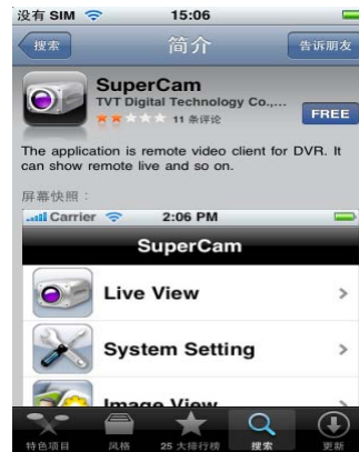
Step 3 : Press “Free”