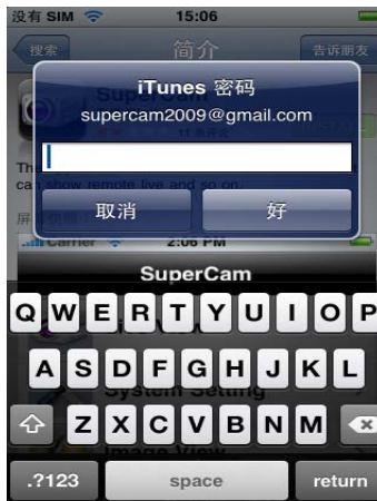
Step 5: Log in with User name and pass word of iTunes Store to download &install