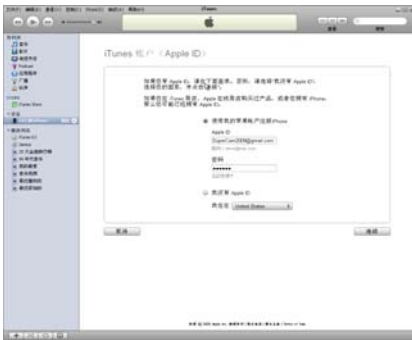
Step 1: install iTunes and log in